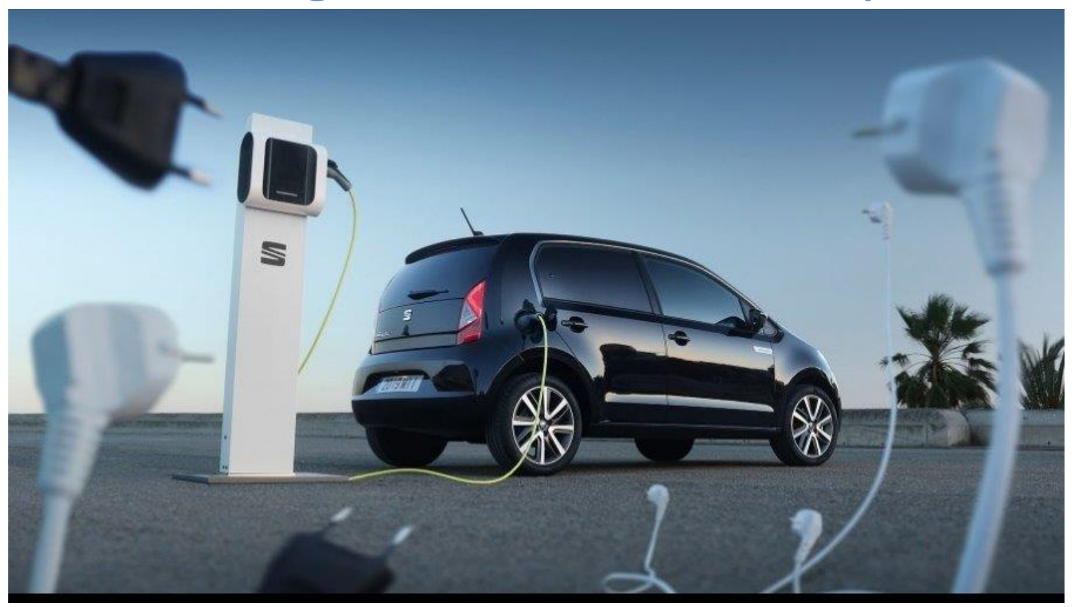
Produced in Bratislava, Slovakia