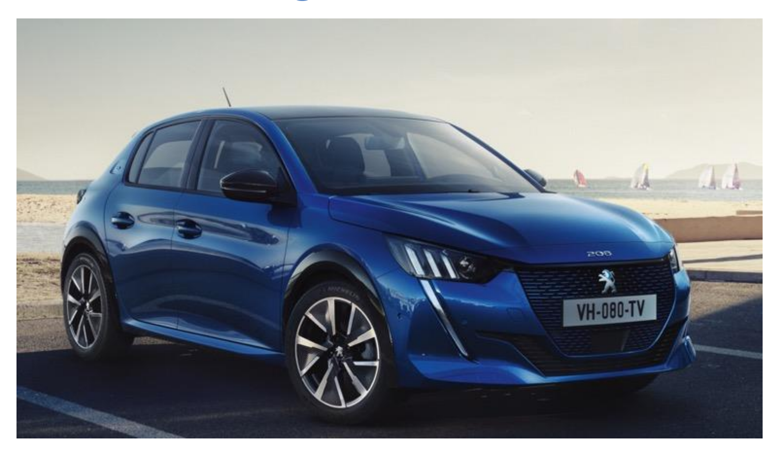
Produced in Trnava, Slovakia