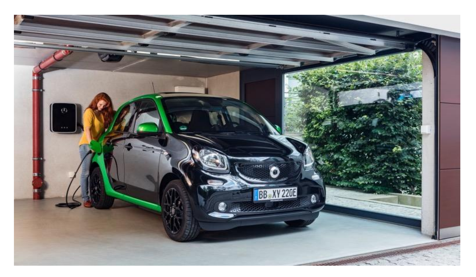
Produced in Novo Mesto, Slovenia