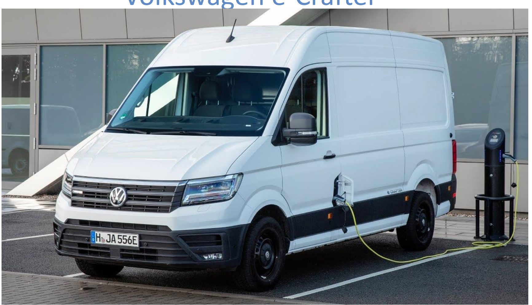
Produced in Wrzesnia, Poland