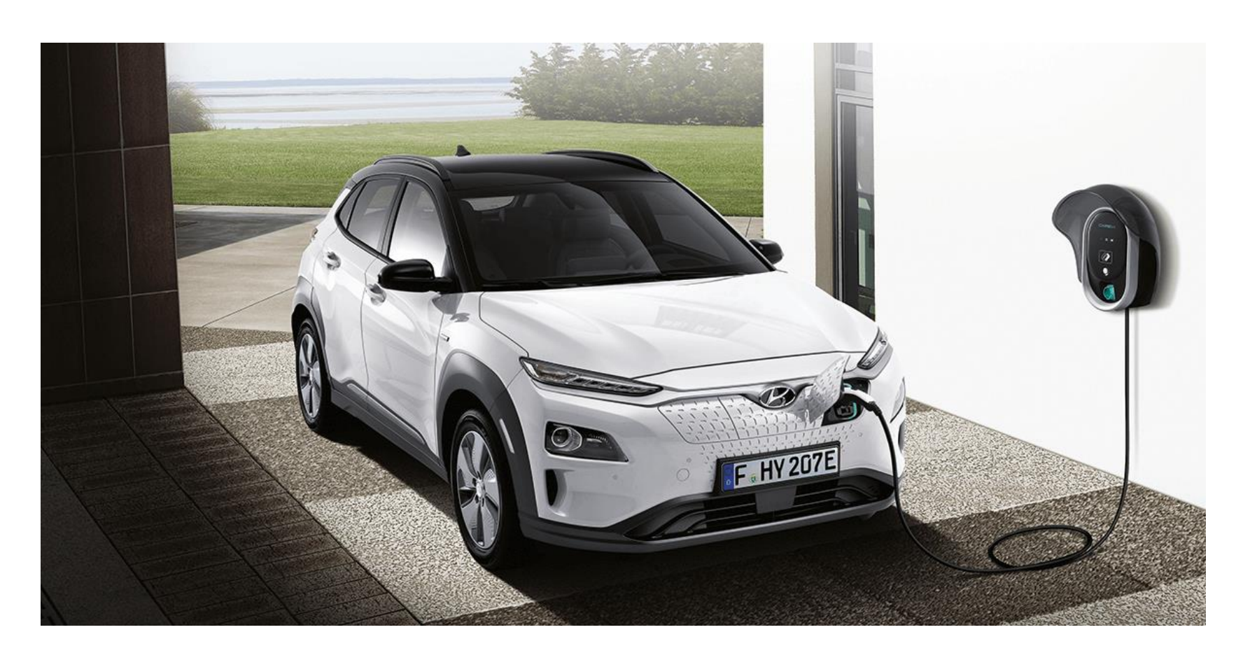
SOP: 2020 (Nosovice, Czech Republic)